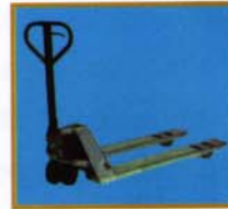
S.S. Pallet Truck