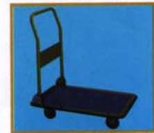
Platform Hand Truck

Pallet trucks and parts are warehoused in Houston / Dallas, Texas. For special requirements, please contact your local distributor.