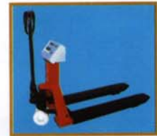
Scale Pallet Truck