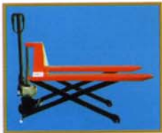
High Lift Pallet Truck