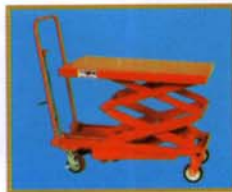
Hydraulic Lift Table