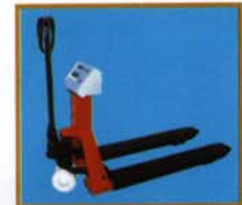
Scale Pallet Truck