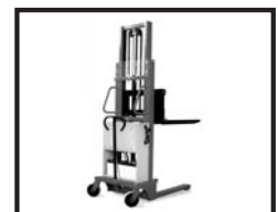
Electric & Manual Stacker for multi-purpose lifting & positioning Compact & Economic

Mighty Lift warrants hydraulic unit and frame against defective components or workmanship for 1 year. Wheels, axles, bearings and seals are warranted for 90 days. Warranty does not cover usage in cold storage, brine, corrosive, or similar applications. Text of warranty is available on request.