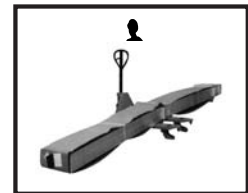
Lateral Pallet Truck features complete lateral movement in a narrow aisle for extra maneuverability