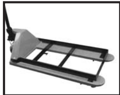
Skid Adaptor allows trucks to be used with both pallet & skid Easy to switch