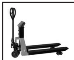
Scale Pallet Truck weighs loads on the spot whenever you want Simple & Efficient