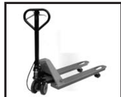
Pallet Truck with Brake System for total control Safe & Easy