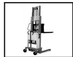
Electric & Manual Stacker for multi-purpose lifting & positioning Compact & Economic

Mighty Lift warrants hydraulic unit and frame against defective components or workmanship for 1 year. Wheels, axles, bearings and seals are warranted for 90 days. Warranty does not cover usage in cold storage, brine, corrosive, or similar applications. Text of warranty is available on request.