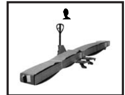
Lateral Pallet Truck features complete lateral movement in a narrow aisle for extra maneuverability