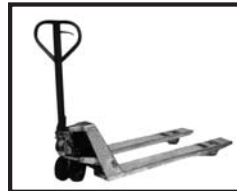
Stainless Steel Pallet Truck for use in food & chemical industries