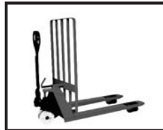
Load Backrest for handling high loads Safe to use