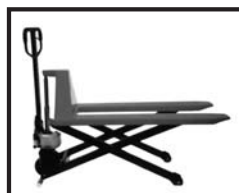
Highlift Pallet Truck a pallet truck & a lift-table All in One Ergonomic & Efficient